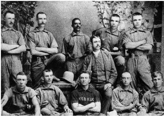
From left to right are: The first African-American professional baseball player John "Bud" Fowler with his Keokuk teammates — Emma Lazarus , writer of "The New Colossus" — Ross Gilmore Marvin — scientist and Arctic explorer (part of Robert Peary's team to attempt to reach the North Pole)