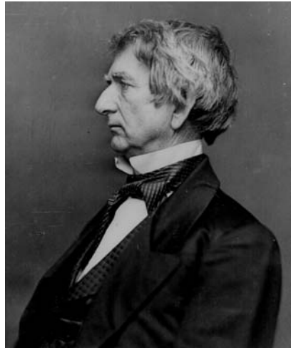
William H. Seward

Today, a plaque in front of the courthouse reminds visitors of the Freeman trial. It reads: "In 1846, William H. Seward in Cayuga County Court House defended a man accused of murder and based his plea on the unprecedented grounds of insanity. Although scorned and humiliated by many for his stand at that time, history has since vindicated him as a man of principle, courage and foresight."