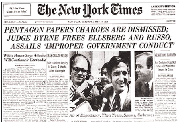
A scanned image of The New York Times front page of May, 1973.

In 1967 Secretary of Defense Robert McNamara commissioned a study of the history of US decision-making of policies involving Indochina, specifically Vietnam. The resulting documents became known as the Pentagon Papers. In 1971, Daniel Ellsberg, a government researcher, gave copies of the documents to the press.