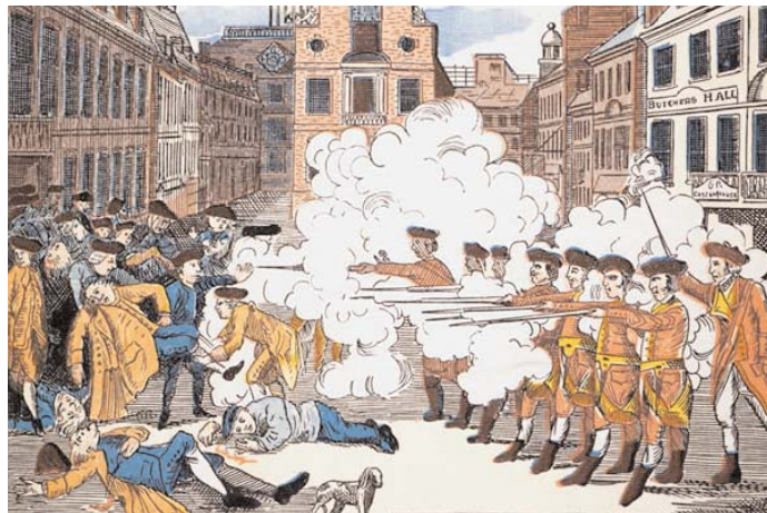
Paul Revere's engraving of the Boston Massacre

After 18 months of tension between the colonists and soldiers, on March 5, 1770, British soldiers fired into a crowd of protesters near the Customs House on