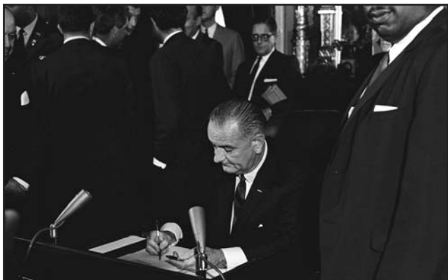
Lyndon B. Johnson signing the Voting Rights Act, August 6, 1965

“The vote is the most powerful instrument ever devised by man for breaking down injustice and destroying the terrible walls which imprison men because they are different from other men.”