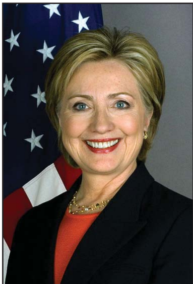
Official Secretary of State Portrait

“Voting is the most precious right of every citizen, and we have a moral obligation to ensure the integrity of our voting process.”