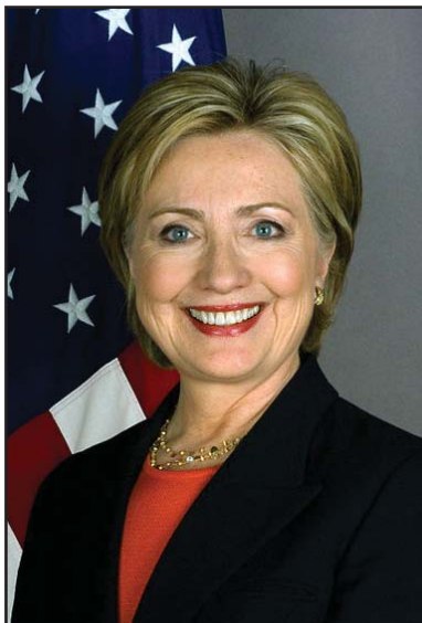
Official Secretary of State Portrait

“Voting is the most precious right of every citizen, and we have a moral obligation to ensure the integrity of our voting process.”